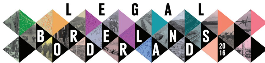
Laying Down the Law: Critical Legal Histories of the North American West

students to History (HIST) courses. A wider variety of classes are offered and the Department has also earned grants for improving undergraduate students' success, which allowed for peer tutoring opportunities and a workshop on increasing student participation and active disciplinary learning. For undergraduates, the History Club is available to all majors and the national history honor society, Phi Alpha Theta, was revitalized at Nebraska. Scholarly activities outside the classroom deepen students' learning and engagement. The number of History majors has been consistent in the last decade thanks to a focus on advising and mentorship. Additionally, the History Alumni Advisory Council recruits and fundraises for the Department.