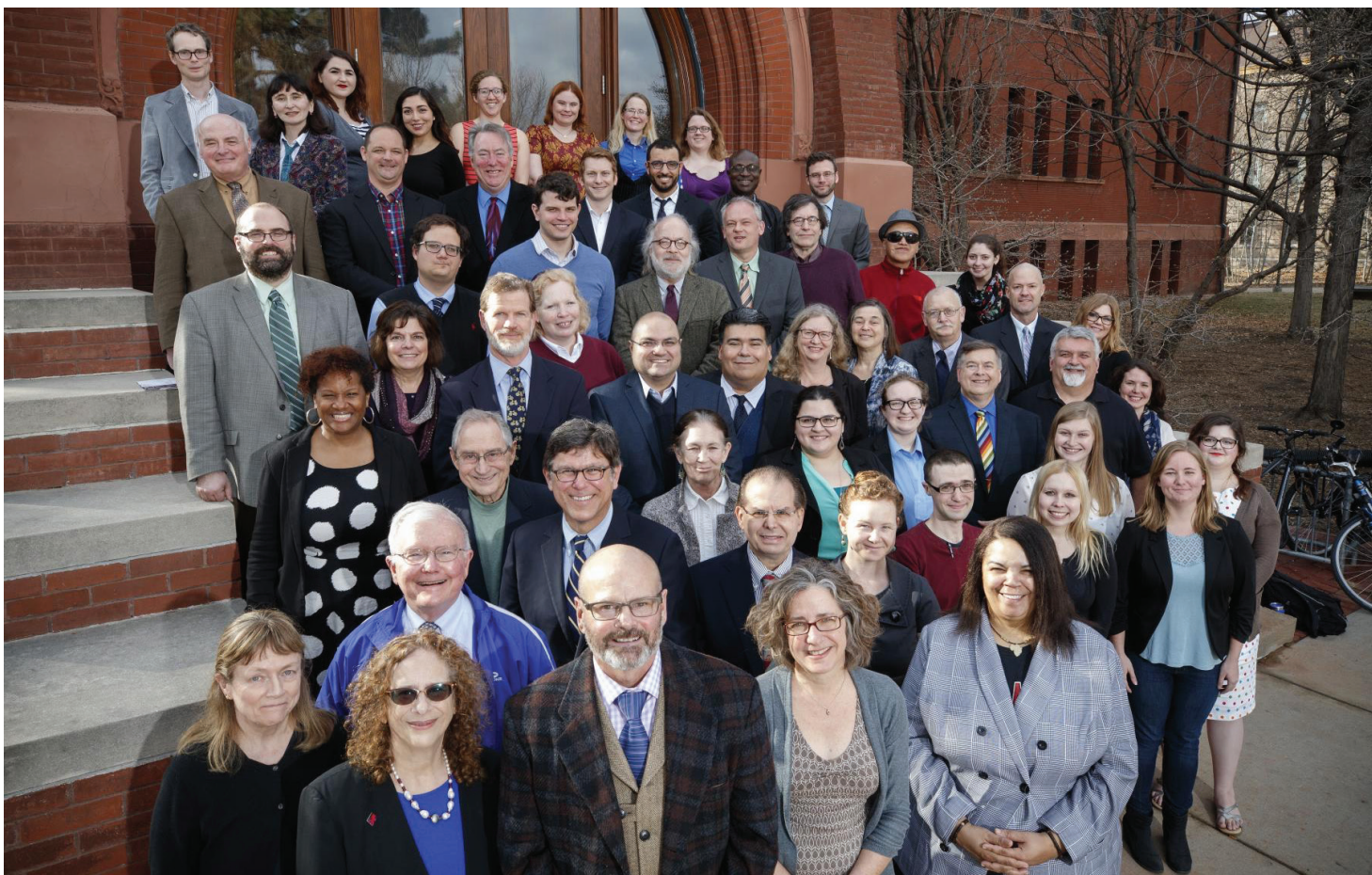
Departmental photo after award ceremony